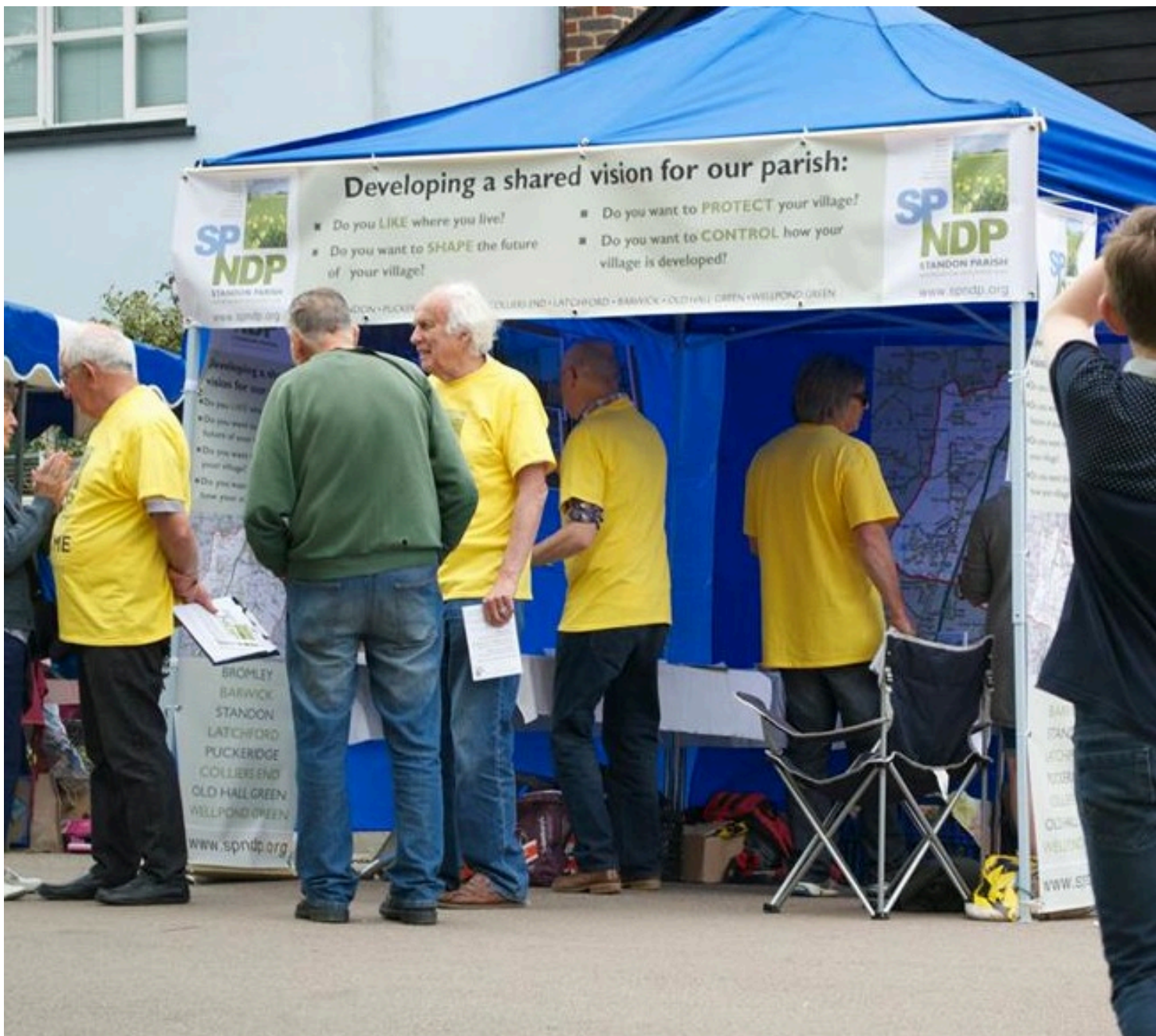
Last years (and our first) May Day event